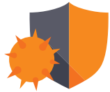
Antivirus & Anti-malware