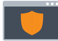
Centralized Management Console