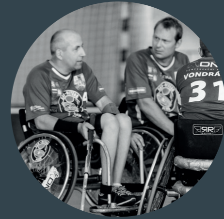
BOARD OF TRUSTEES FUND