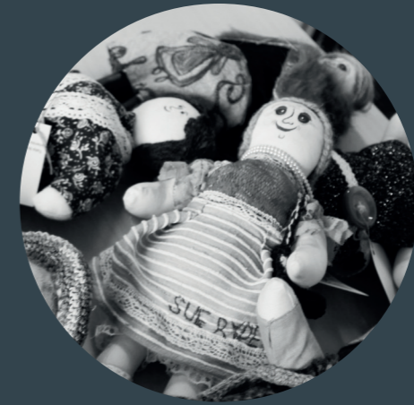
AVAST EMPLOYEE FUND