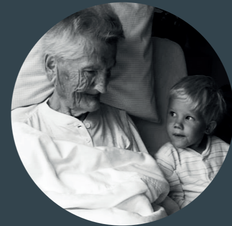
TOGETHER UNTIL THE END Pilot programme supporting the care for the dying in the Czech Republic