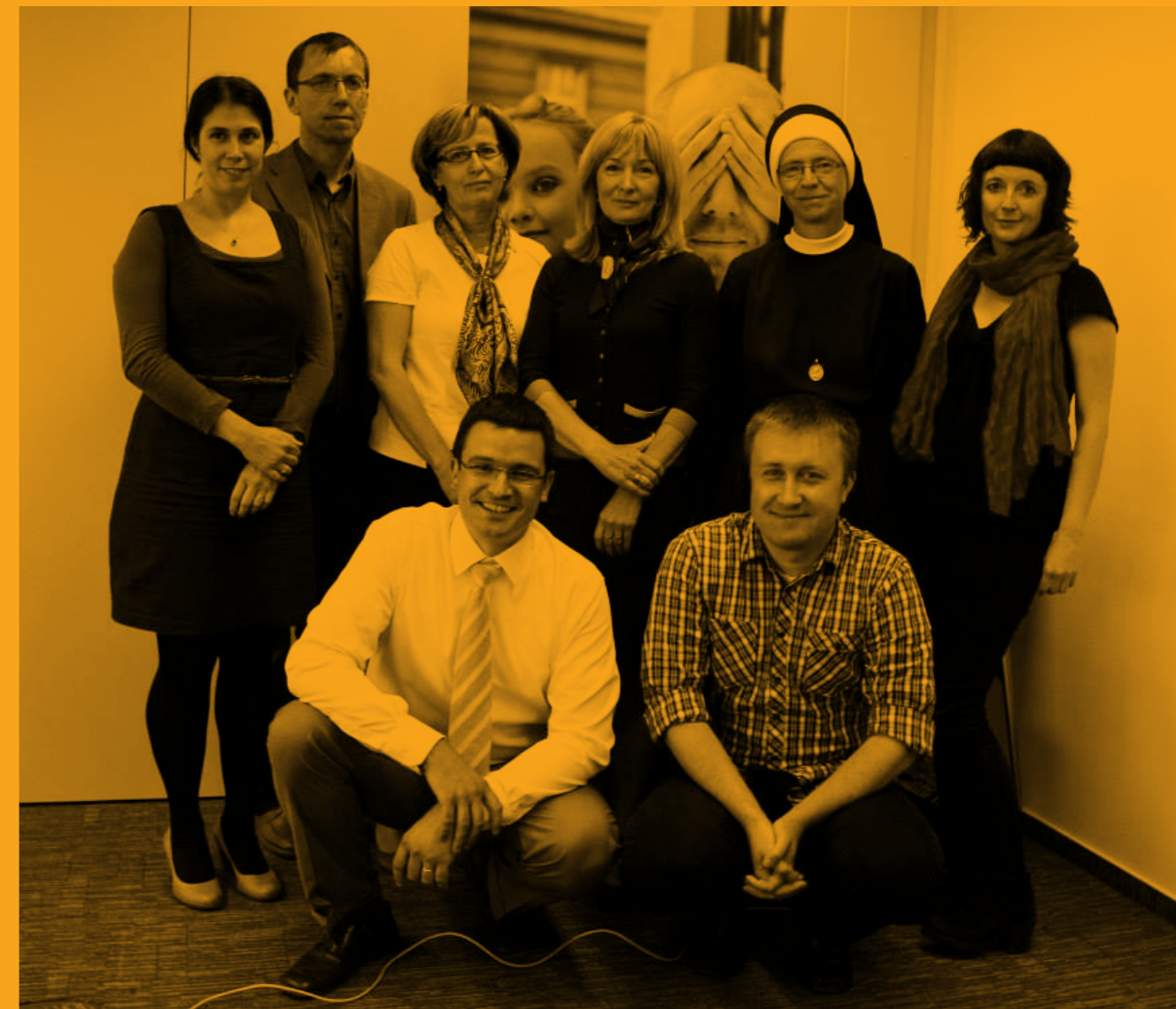
AVAST Foundation Board of Trustees and expert evaluators in the programme

ODDICUS: Is care provided to patients at the end of their lives in harmony with their wishes and values? A prospective observation project on patients who died in a tertiary health-care facility. A research project implemented under the support of a large hospital. Thanks to it, it will be possible to obtain interesting feedback and suggestions for improvement of palliative care in hospitals and other health-care facilities.